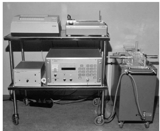
Figure 2. Photo of the first machine in Norway (a Studsvik forearm scanner (DPA=dual photon absorptiometry) measuring bone mineral density (BMD) obtained at Aker University Hospital in 1975.

The first DXA-machines (Dual-energy X-ray absorptiometry) that can measure the whole body including the hip and vertebrae were acquired in 1991 by two groups of private specialists in Oslo (T. Ruud, gynecology and J. Halse, endocrinology). In 1992 the Aker university hospital received a DXA-machine as a gift